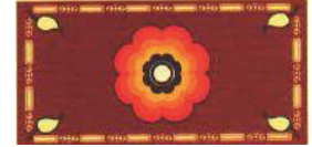
President of Sri Lanka Democratic Socialist Republic of Sri Lanka